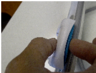
Fig 1. Squeeze to unlock