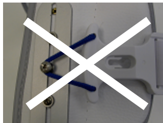
Fig 5. Incorrect Application