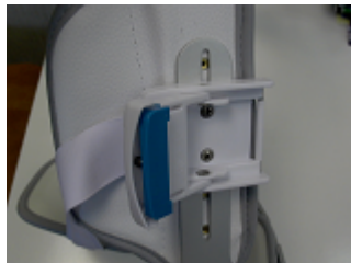
Fig 2. Unlocked