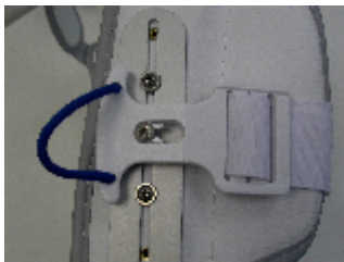
Fig 4. Hook over post